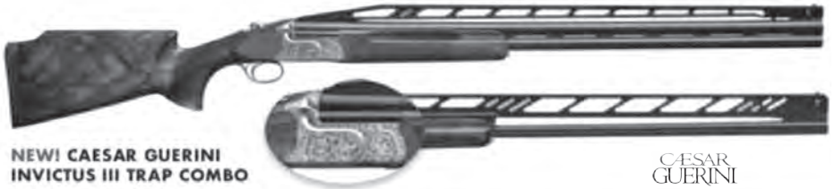
NEW! CAESAR GUERINI INVICTUS III TRAP COMBO